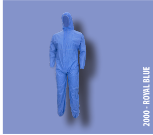
2000 - ROYAL BLUE