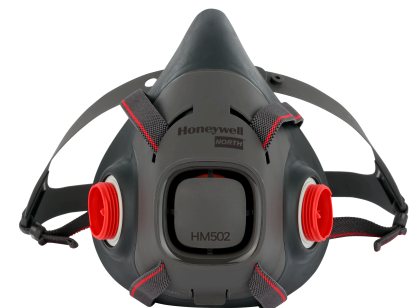
HM502, drop-down version