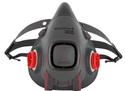
HM501, non-drop-down version