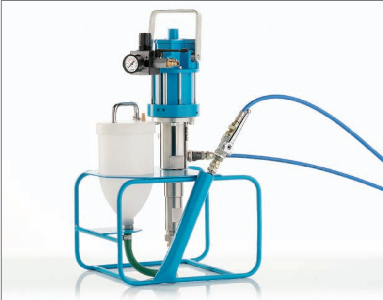
The WIWA Inject HD 1 is equipped with a feed funnel for approx. 1.5 liters (3 pints) of resin and an injection lance.