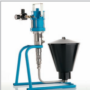
The WIWA Inject HD 2 with 6 liter (1.5 gallon) feed funnel