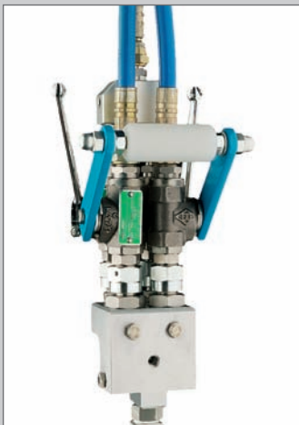
Mixing unit complete with static mixer and separate flush assembly for the A and B components